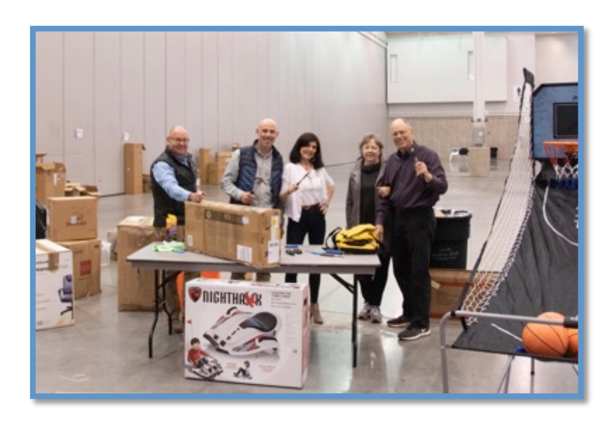
An Evening with Friends Celebrating The Achievable Dream