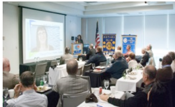
Close quarters in a temporary new room