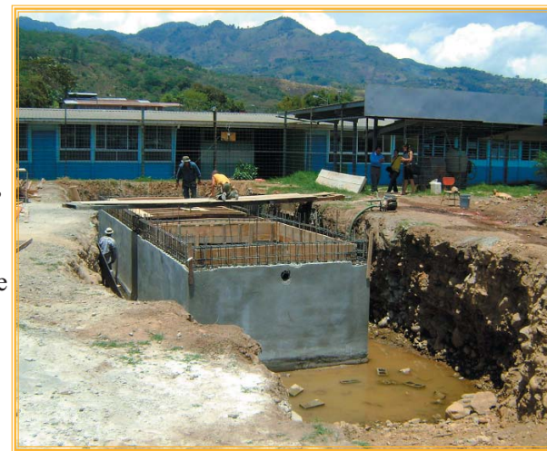
A result of our Carmen Lyra effort. The school's first sewage treatment system.